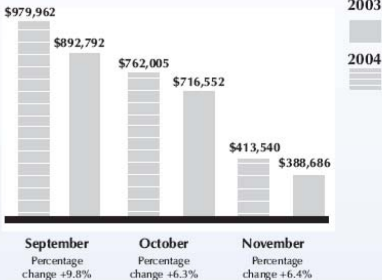
Horry County Accommodations Tax Collections